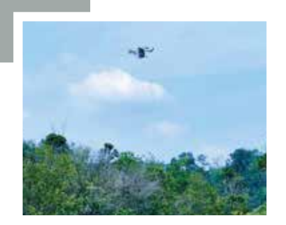
Custom cargo delivery drone photo taken in Teknologi Park Malaysia